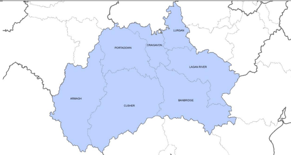
A map showing the location and area covered by the two DEAs that the Armagh plan is for is shown above.