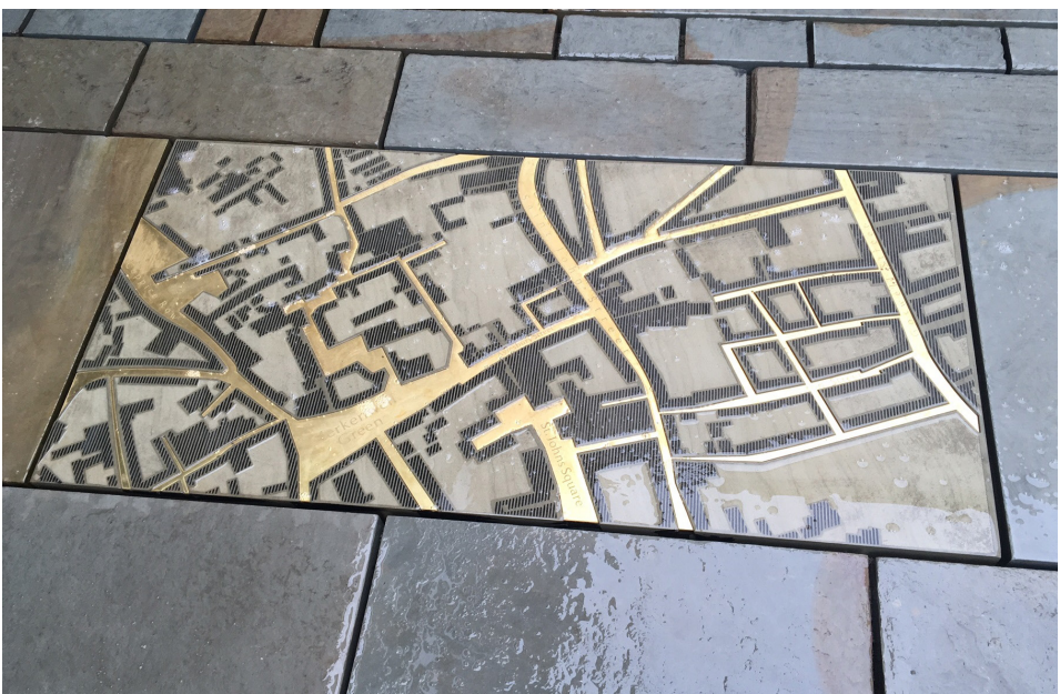
Bespoke paving could integrate old street map features to help provide a sense of place

The selected concept images below provide examples of the approach that GM Design Associates are considering in terms of potential paving materials, lighting, historic features and tree planting that could be used on this scheme. We welcome your views on the style of this approach for the Dromore Public Realm Scheme.