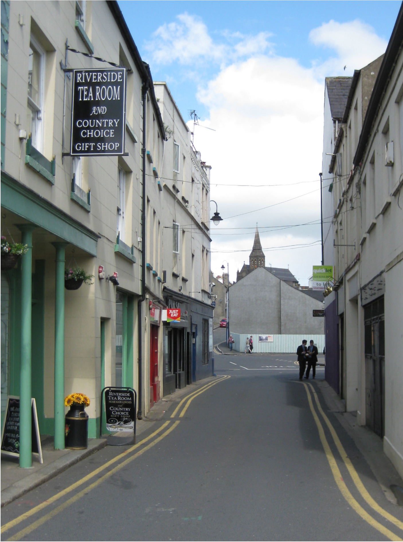
BRIDGE STREET EXISTING

The visuals below provide examples of the approach that the GM Design Associates are considering in terms of potential paving materials, lighting, historic features and tree planting that could be used on this scheme. We welcome your views on the style of this approach for the Dromore Public Realm Scheme.