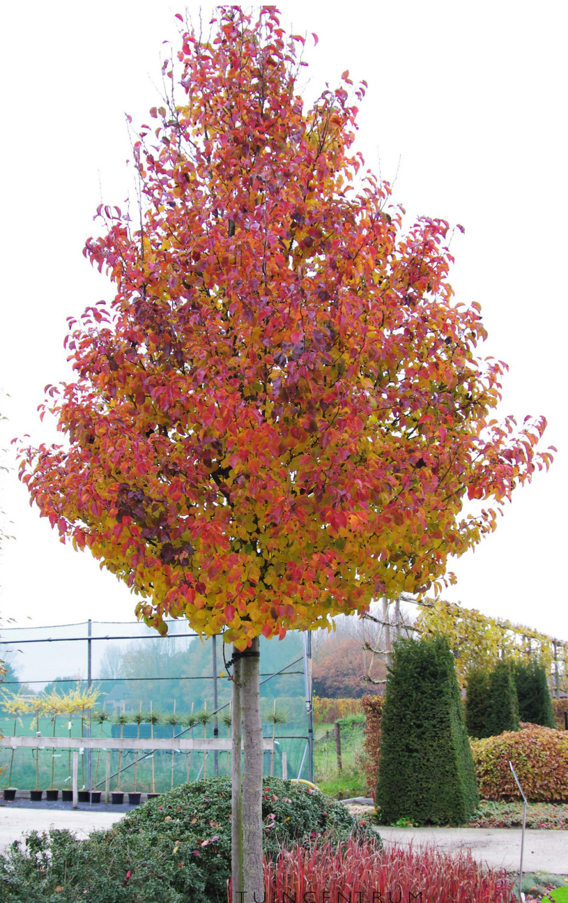
New tree species will be selected with compact growing crowns and all year round seasonal interest