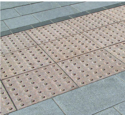
New tactile crossing points will be provided