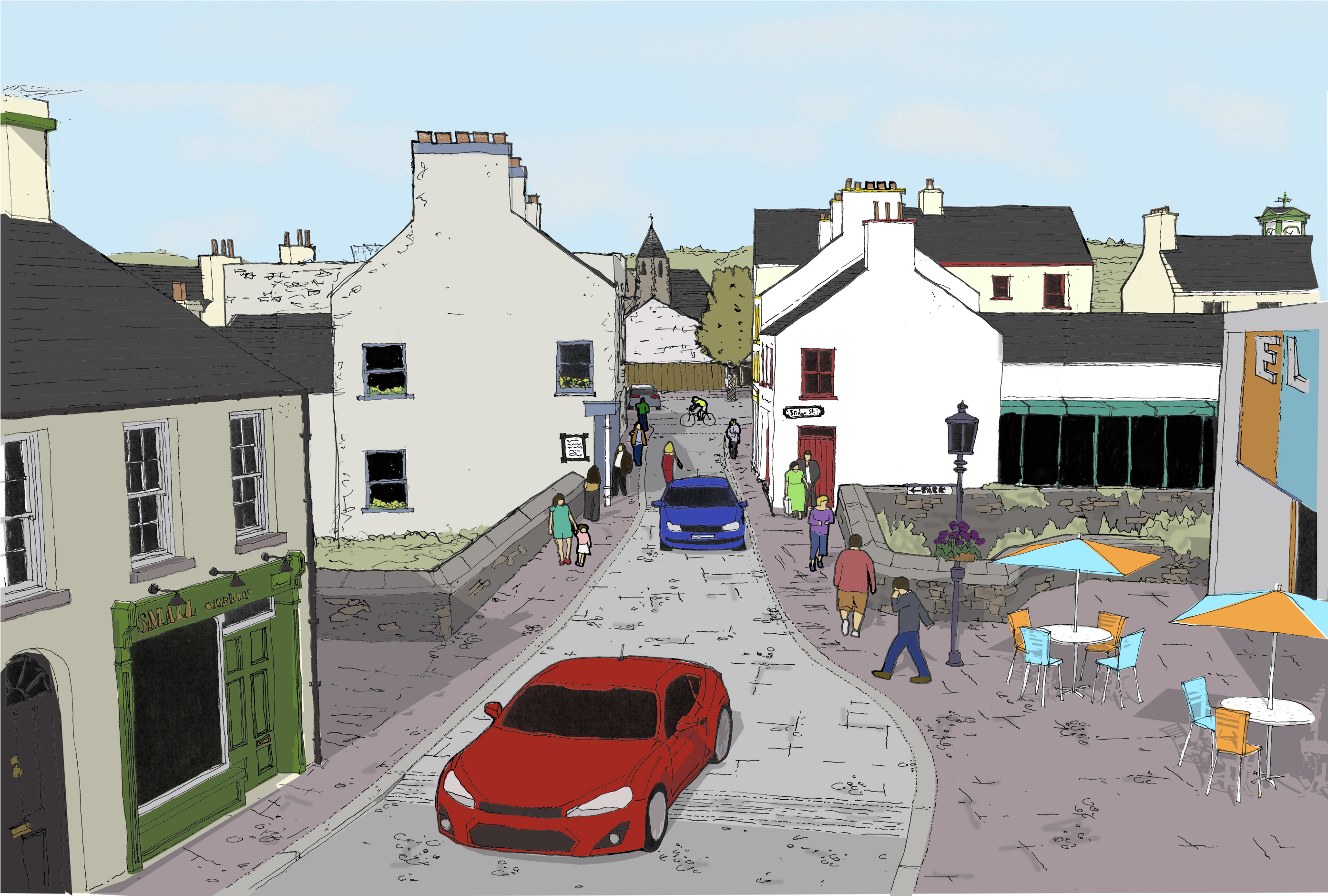
This visual above shows how new public realm spaces can be provided around Downshire Bridge on Bridge street.

The number of parking spaces will not be affected in the project area. However some relocation of spaces are proposed around Market Square to allow for the widening of footpaths and creation of a bus boarder which will provide a safe and accessible point to embark and disembark the bus.