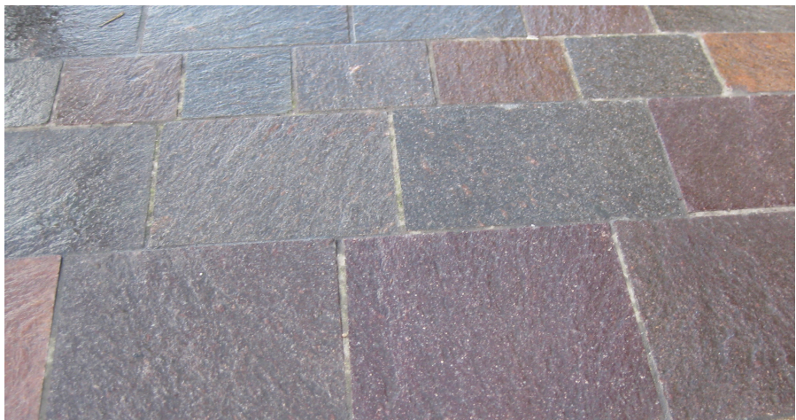
Warm colours of Italian Porphyry paving could be used to compliment the existing works to the inner part of Market Square