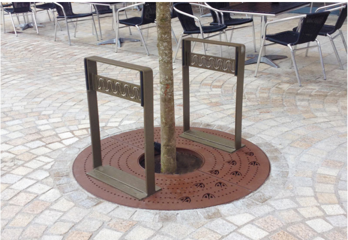
New cycle stands could be integrated with Tree Grilles to help reduce street furniture clutter