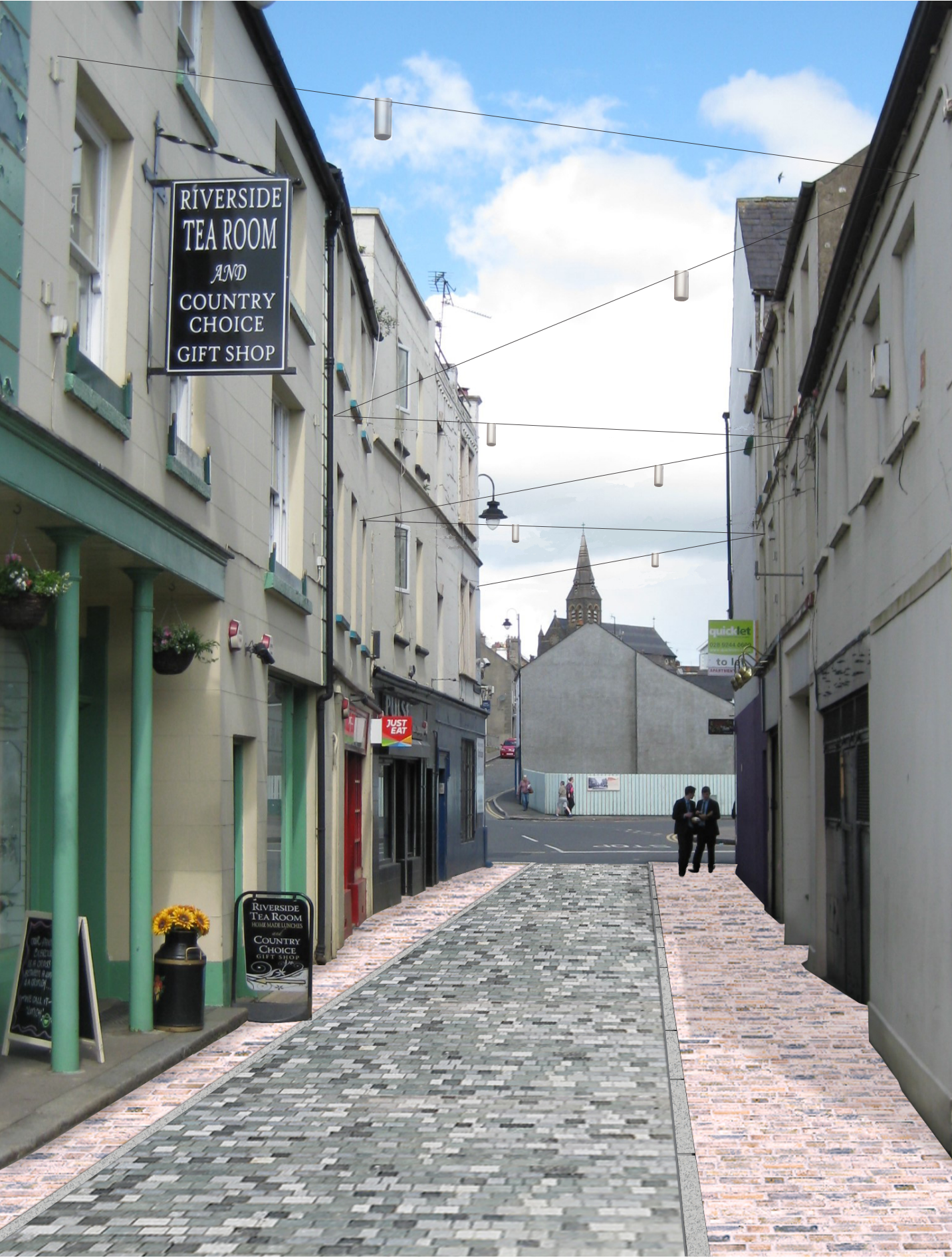
BRIDGE STREET PROPOSED

The visual above shows how the proposals intend to provide a new footpath to Bridge Street to help pedestrian safety.