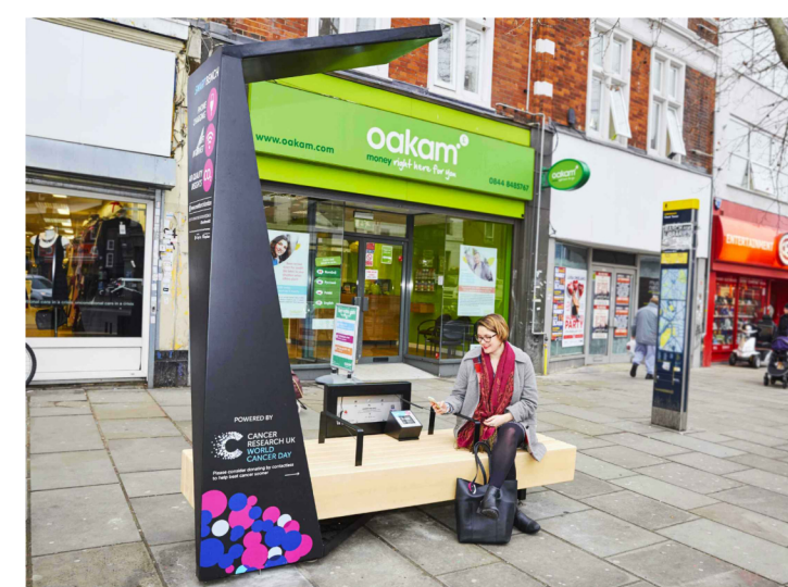
Illustrative images of proposed SMART bench at Visitor hub opposite Poplar Row access