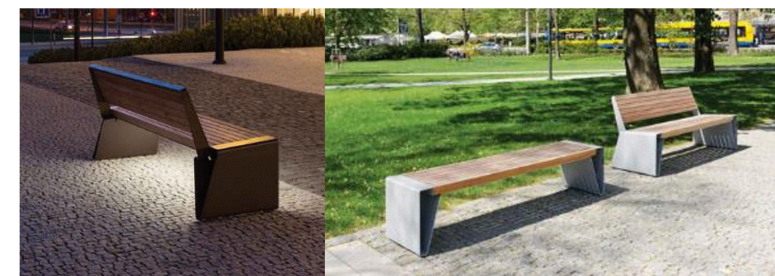
Illustrative images of proposed new seating (bench and seat) with integrated LED lighting to provide interest and illumination to streetscape