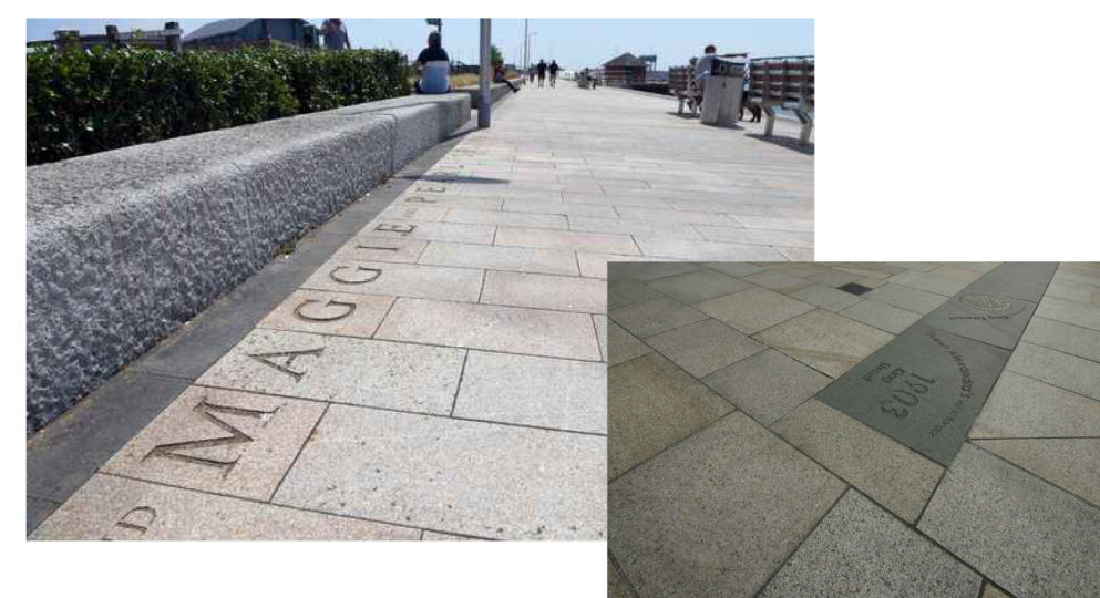
Illustrative images of potential paving inserts and etched paving proposed at entrances to The Mall