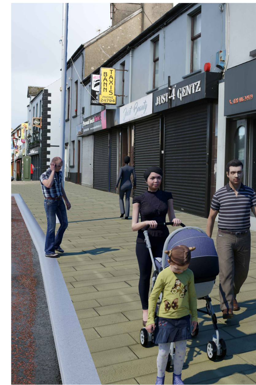
Artists impression of Newry Street - illustrating new natural stone kerbs and paving to footpath