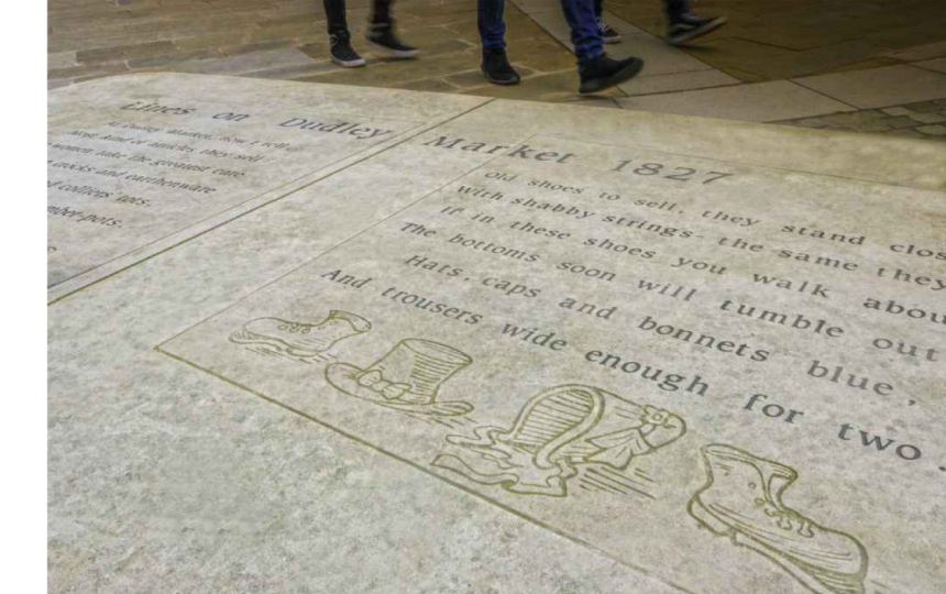
Illustrative image of text etched into paved surface. Text on Downshire Bridge to reference local poetry / written reference