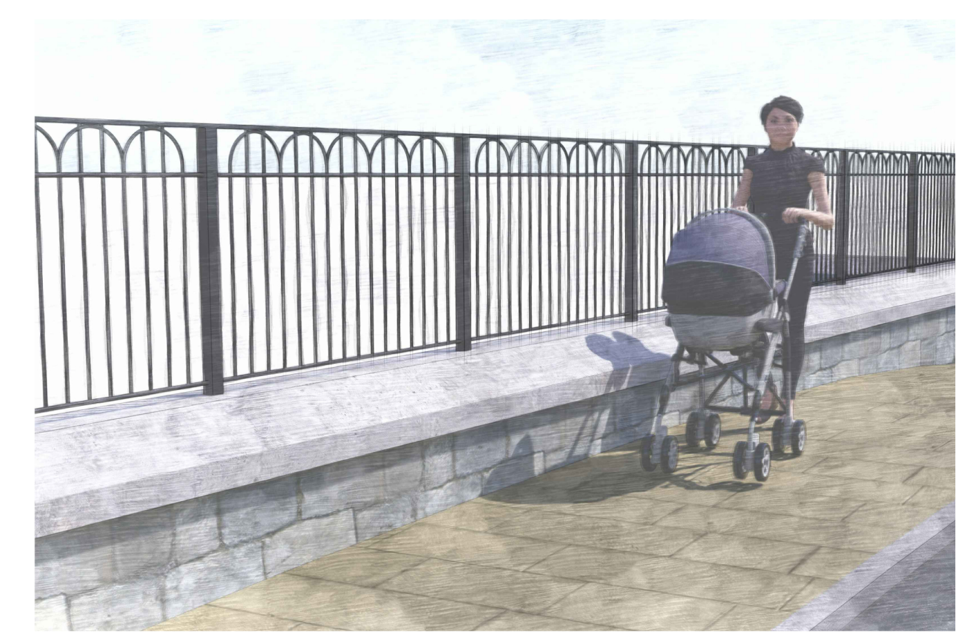
Artists impression illustrating widening of footpath, reinstatement of kerb and new railings to top of Downshire Bridge.