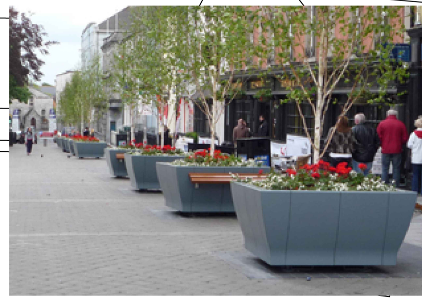
Illustrative image of proposed raised planters with integrated seating and trees in Railway Street Linkage